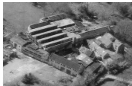
The Freshford Mill site - run down and often flooded

In a surprise vote, the planning committee refused - unanimously - permission to put 26 flats and 3000 sq m of light industrial and office space in the run-down buildings at Freshford's Peradin site.